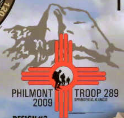
PHILMONT 2009 TROOP 289 SPRINGFIELD, ILLINOIS