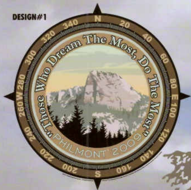
TROOP 555 San Diego, California